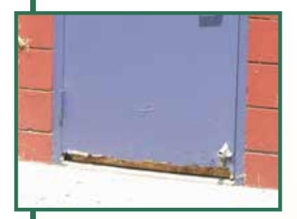
Classroom doors with dry rot need to be replaced for safety and energy efficiency purposes.

Our local schools are between 35 and 55 years old and need essential repairs and upgrades to maintain a safe and modern learning environment. Additionally, the state has transitioned to the Common Core State Standards, which require new methods of evaluating student academic performance and will begin Spring 2014. These evaluations will require new instructional techniques and updated classroom technology since the standardized tests will now be computerized.